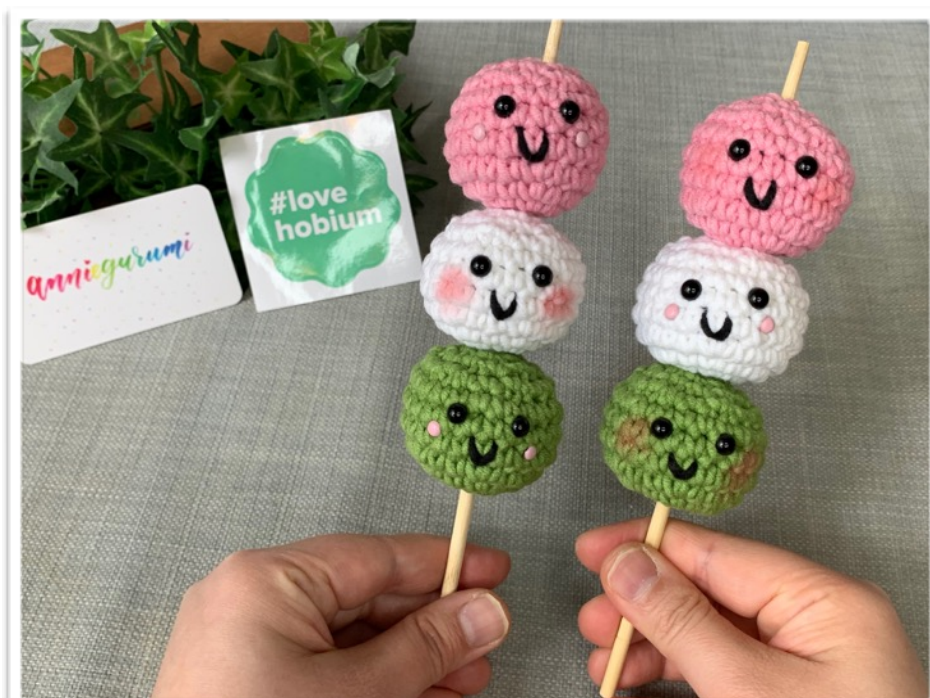
花見団子 Mochi Dango about 4cm in diameter

Hi friends! This is the first pattern and video tutorial in my amigurumi series on youtube with my friends at Hobium Yarns. If you're new to amigurumi, I hope you find it helpful. I will do my best to bring you tutorials, tips and tricks. You can see the advert here for the series.