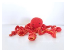
OCTOPUS click here