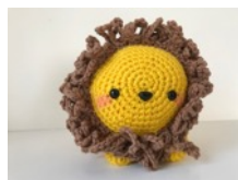
CHUBBY LION click here