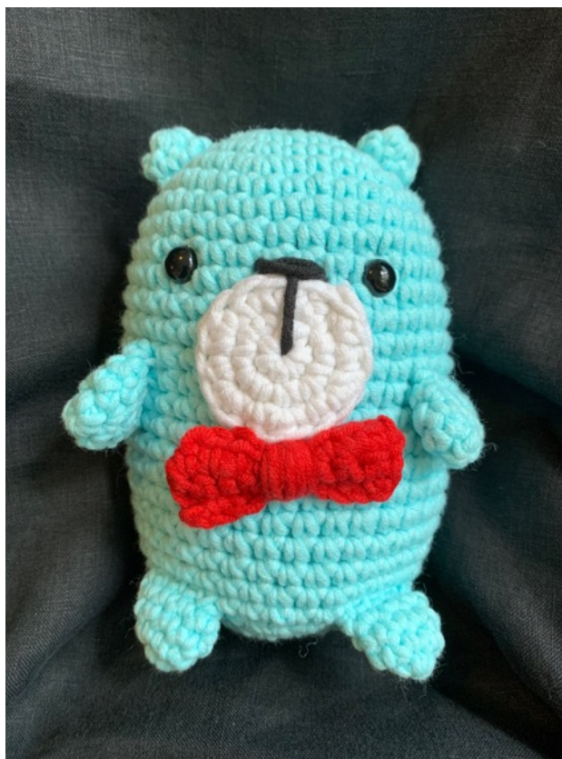
Blue Bear measures about 12 cm top to bottom

Hi friends! This is the first pattern and video tutorial in my amigurumi series on youtube with my friends at Hobium Yarns. If you're new to amigurumi, I hope you find it helpful. I will do my best to bring you tutorials, tips and tricks. You can see the advert here for the series.